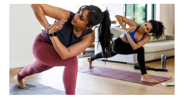
Mindset for lifestyle changes: Find the right mindset (video).