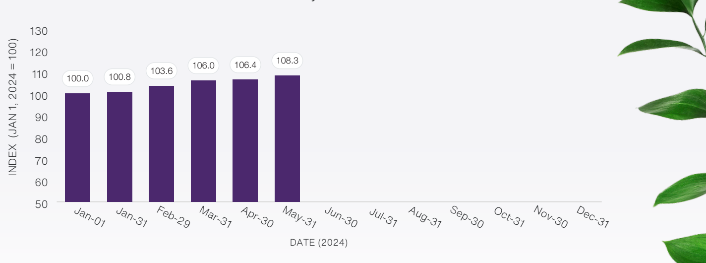
Annuity proxy index