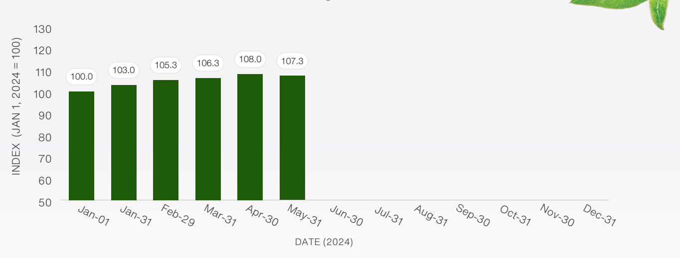
Plan asset index